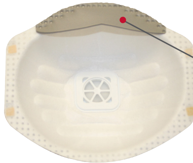
Soft foam nose for extra comfort