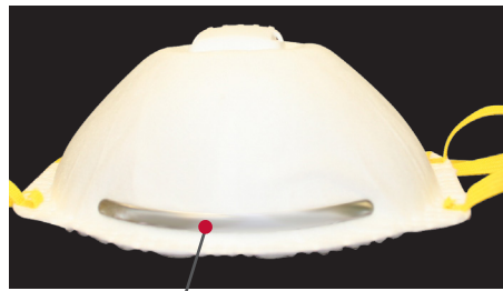
Adjustable aluminum nose bridge for a more secure fit