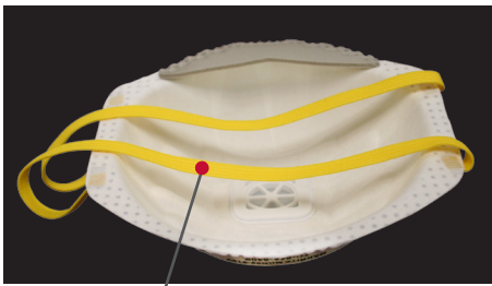
Double elastic comfort fit straps